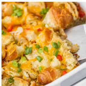
Croissant Breakfast Casserole with Sausage