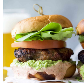
Southwestern Turkey Burgers