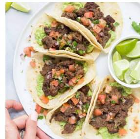
Skirt Steak Tacos Recipe