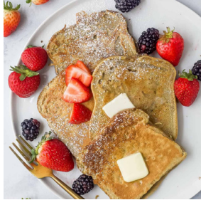
Protein French Toast