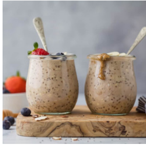
Protein Overnight Oats