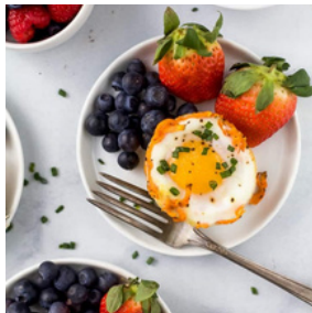
Easy Sweet Potato Hash Brown Egg Cups