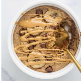
Easy Chocolate Peanut Butter Baked Oatmeal