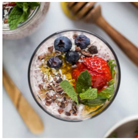
How to Make Strawberry Chia Pudding