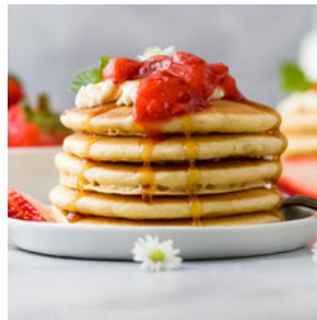
Fluffy Pancake Recipe With Strawberry Compote Vanilla...