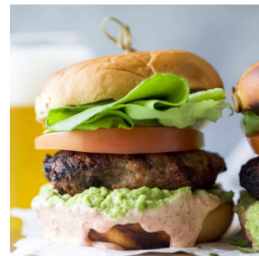
Southwestern Turkey Burgers