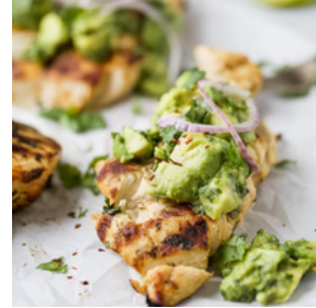
Cilantro Lime Grilled Chicken