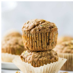
Healthy Zucchini Muffins (So Moist!)