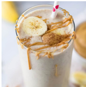
Peanut Butter Banana Smoothie Recipe