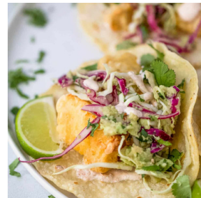
Beer Battered Air Fryer Fish Tacos