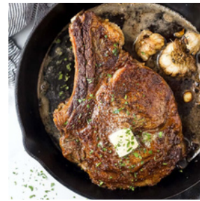
Ultimate Cast Iron Cowboy Steak with Chimichurri